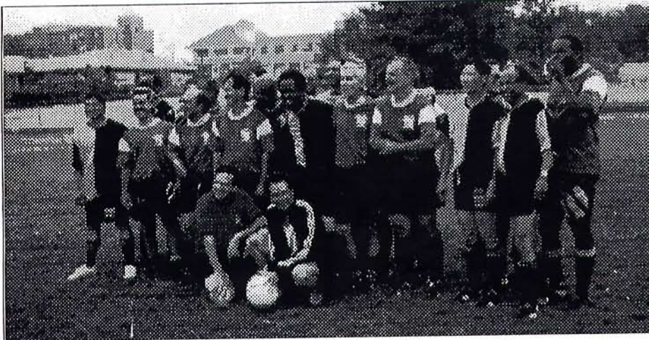
Above: The Queen's College 1997 soccer team